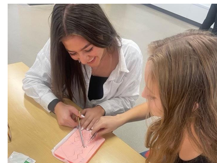
Figure 4: General members participating at Cure Found's suture clinic led by an Emergency Medicine Physician.