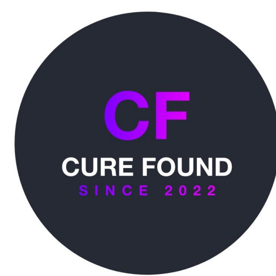
Figure 2: Cure Found MSU's Official logo