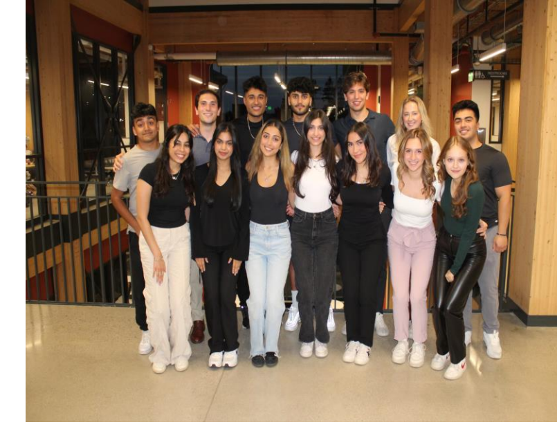
Figure 6: Cure Found's 2023-2024 Executive Board Team at the Fall 2023 kick-off meeting.