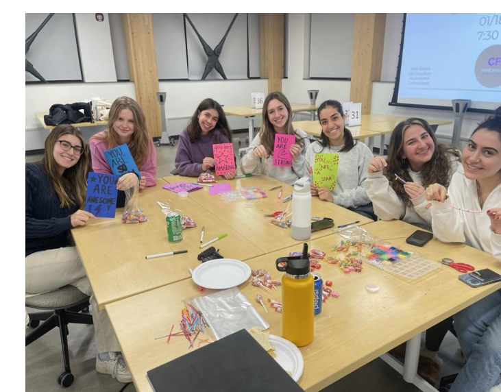
Figure 8: Cure Found members volunteering their time at the Spring 2023 volunteer event for Cystic Fibrosis children.