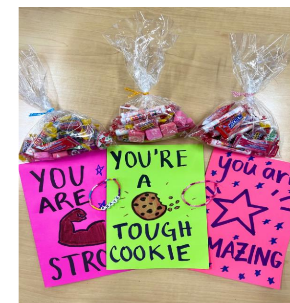
Figure 5: Bracelets and goodie bags that were made by club members and donated to MSU's CF Center for children with Cystic Fibrosis.